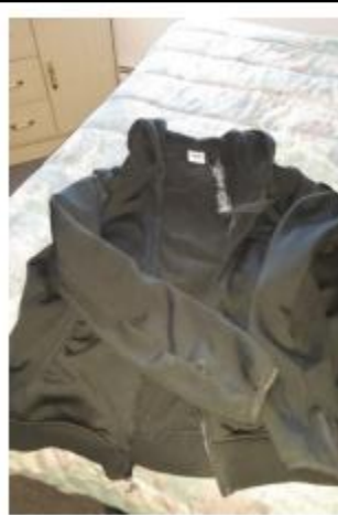
Harley Davidson Leather Jacket with hooded sweatshirt zip out lining. Great for the cooler weather, with or without lining. Excellent condition, only worn one season. Women's size 1W. Asking $200.