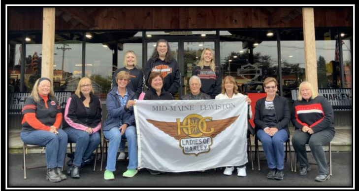
Ladies of Harley