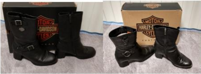
Womens Harley boots size 7 1/2 in excellent condition Contact Sandy Bruno at 577-5292 Asking $ 70 or best offer