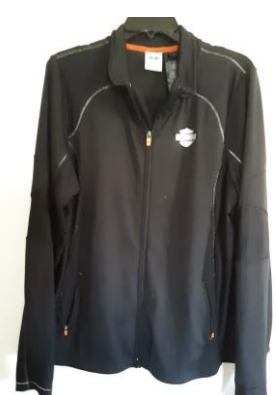
Women's vest. Light weight jacket size 1W and a Men's Mid-Maine HOG jacket size 2XL. Asking $30 each item. Contact Anita FMI.